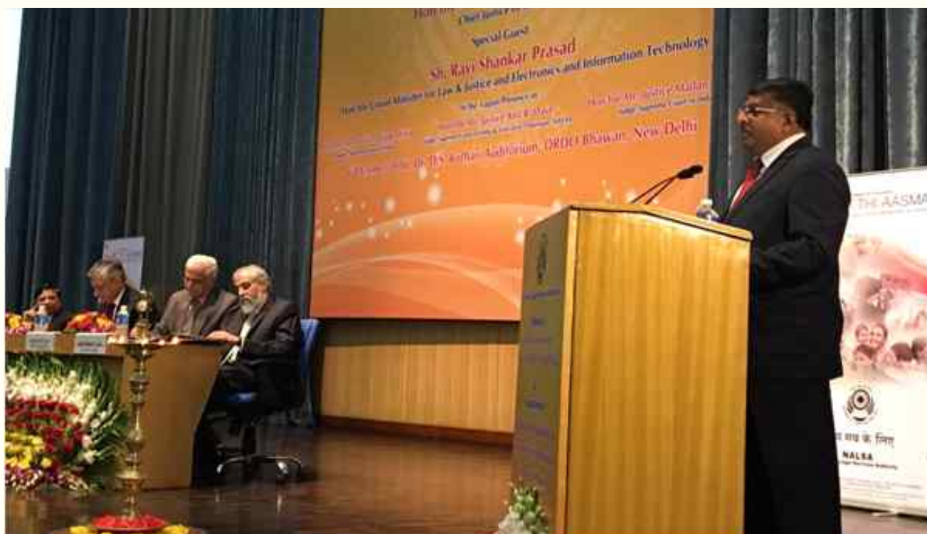
Sri Ravi Shankar Prasad, Hon'ble Union Minister for Law & Justice and Electronics and Information Technology, delivering his address on 1 st of October 2016. Hon'ble Mr. Justice T.S.Thakur, Chief Justice of India, Hon'ble Mr. Justice Anil R. Dave, , Hon'ble Mr. Justice Dipak Misra, Hon'ble Mr. Justice Madan B. Lokur are on the dais.

The Theme Song of the National Legal Services Authority (NALSA) was officially released and the Web portal of NALSA was also launched on 1 st of October, 2016 at New Delhi . To coincide with the event, a National Consultation was held on “Challenges in Mediation and the Way Forward”.