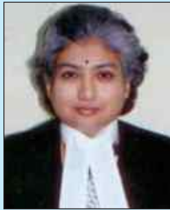
Hon'ble Mrs. Justice B.V.Nagarathna