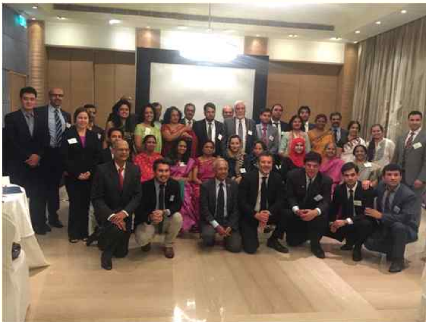
PARTICIPANTS IN THE WORKSHOP ON “ADVANCED MEDIATION TECHNIQUES” AT ITC GARDENIA BENGALURU

Certificates of participation were presented to all the participants.