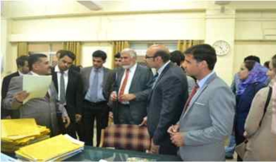
Delegates from Afghanistan discussing at BMC with the Director, BMC.