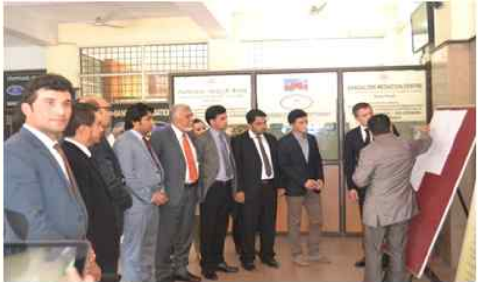
Delegates from Afghanistan discussing at BMC with the Director, BMC.