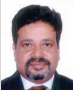
Justice Anand Byrareddy, Judge, High Court of Karnataka